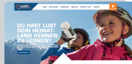
Willkommen bei Stadt-Land-Rad einem Projekt des ADFC

Stand & End Heidelberg Central Station Transfer Bus shuttle to Sinsheim